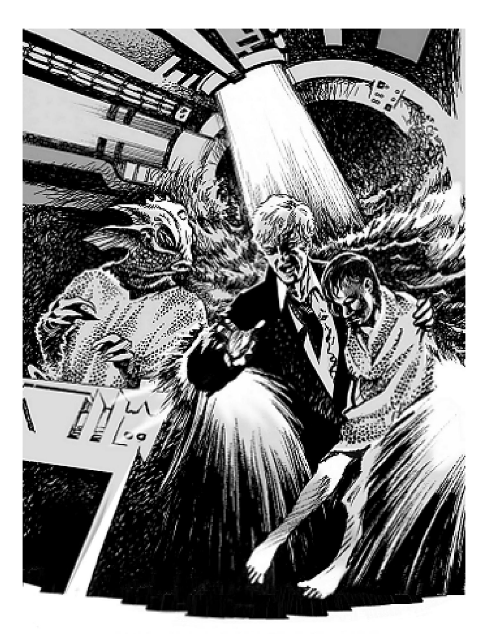
For a moment it seemed as if they were safe, then a massive inrush of water filled the cabin

The man who was obviously the group's look-out heard the whistle. He was about to give one back when a large lump of rock caught him behind the ear. He dropped like the proverbial stone, but before he even hit the ground, he was yanked back into the darkness of a recess in the cliff.